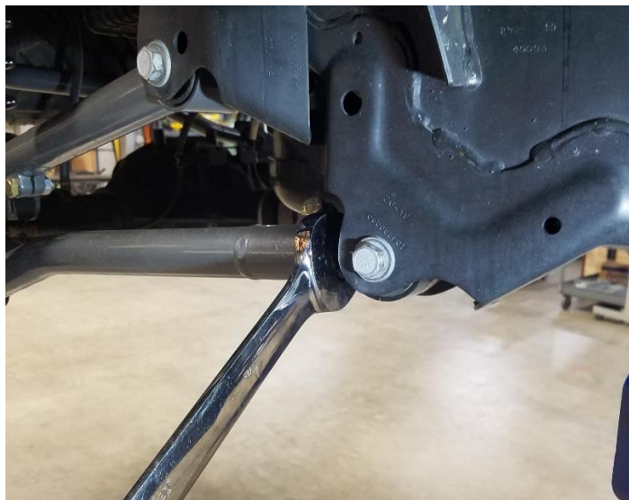
Figure 5. Adjusting the Arm to Set Axle Position.