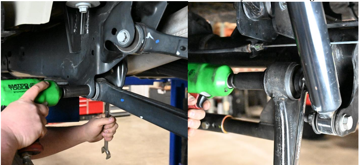
Figures 1. and 2. Removing the Drivers Side Factory Lower Control Arm.