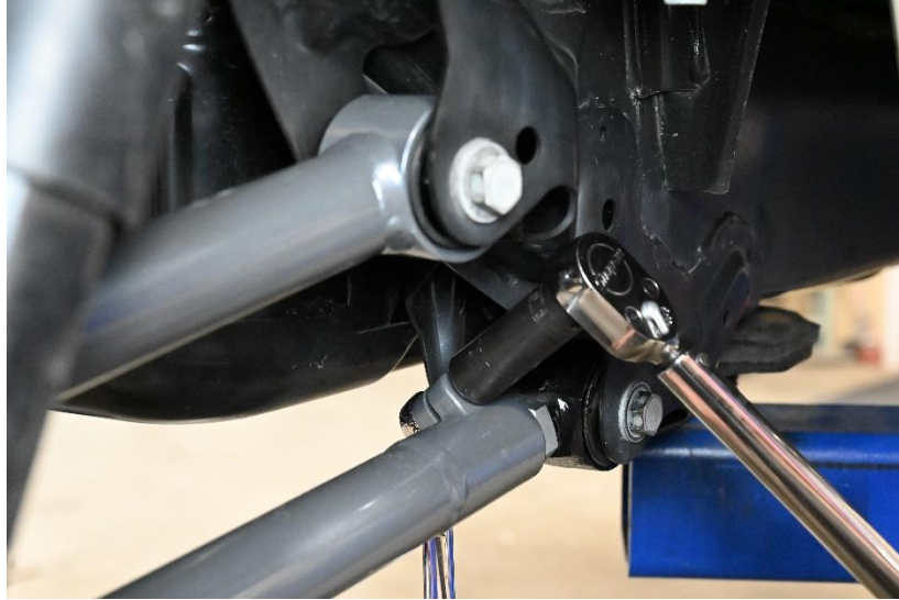
Figure 6. Tightening the Pinch Bolt