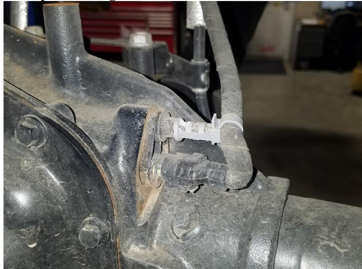
Figure 1. Disconnect E-locker plug and retaining clip.