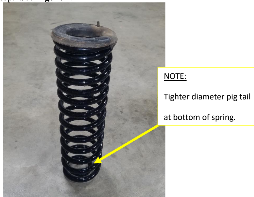
Figure 2. Installing the stock rear spring isolators.