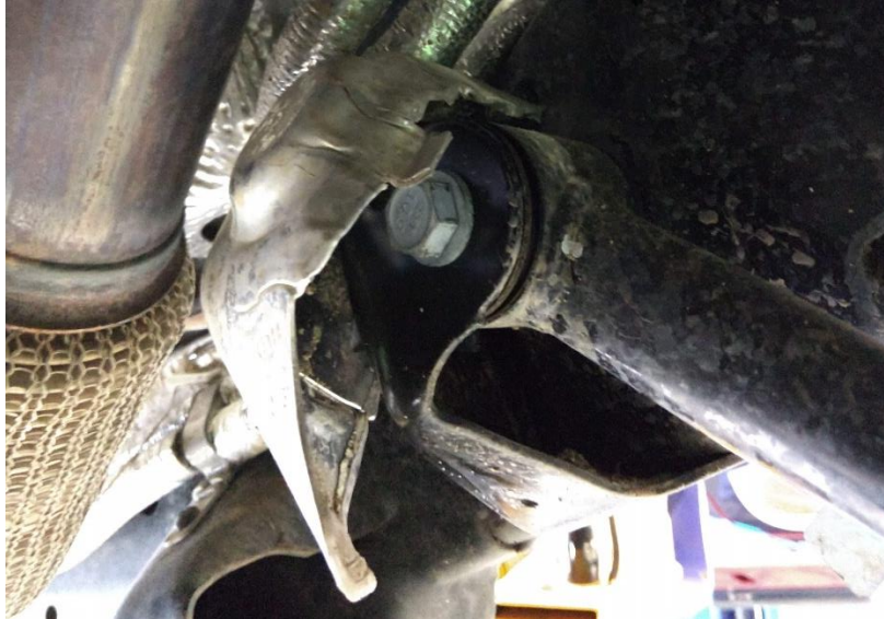
Figure 1. Front Upper Control Arm Heat Shield Bent Out