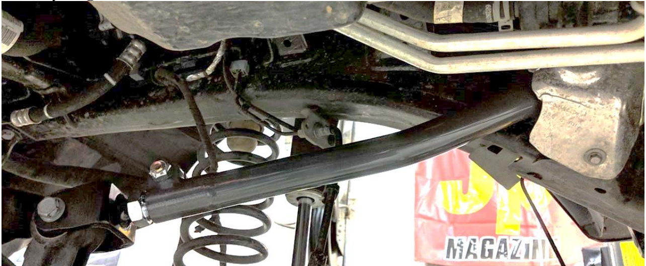
Figure 4. Synergy MFG Right-Side Control Arm Installed With Heat Shield