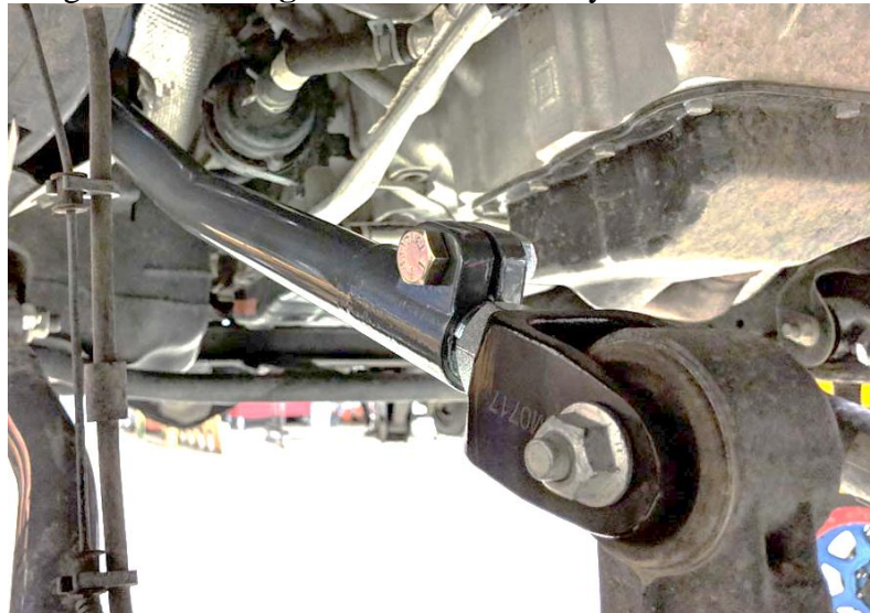
Figure 2. Correctly Installed Synergy MFG Right Front Upper Control Arm