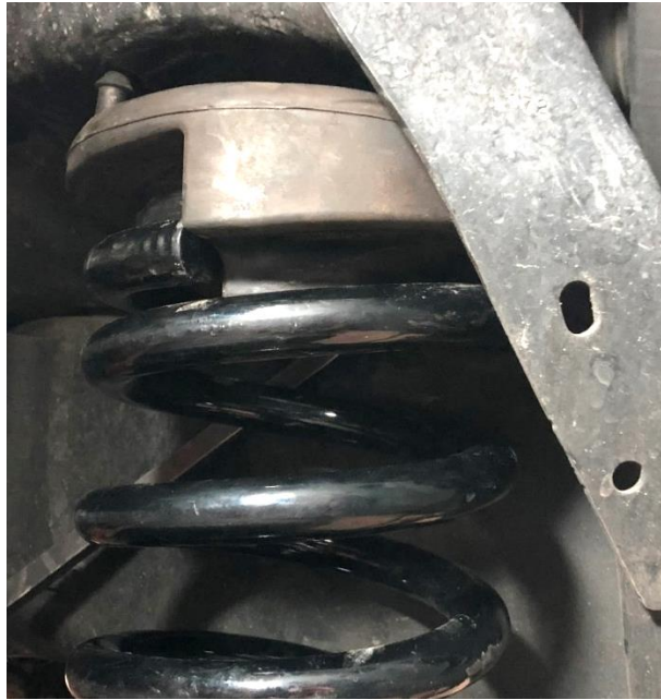
Figure 2. Synergy Leveling Spring Installed - Spring Isolator Not Fully Seated