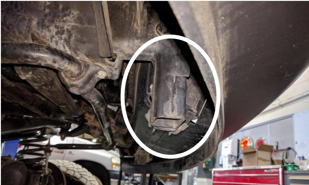
Figure 1. Factory Plow Mounts