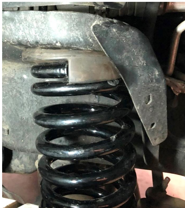
Figure 3. Synergy Leveling Spring Installed - Upper Spring Isolator Correctly Seated