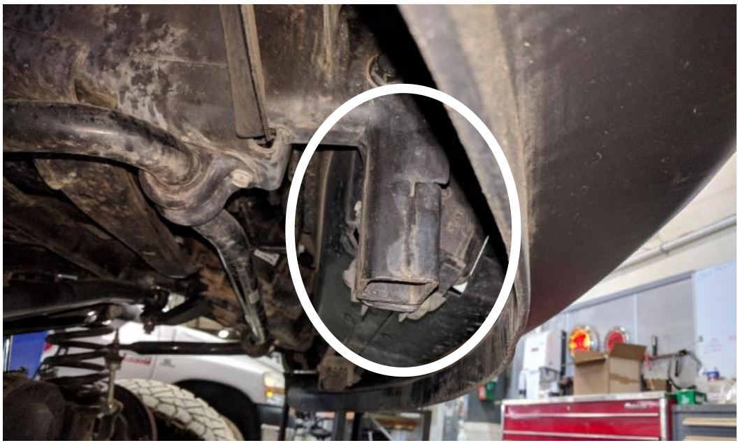
Figure 1. Factory Plow Mounts

4. Remove the factory springs. Pay close attention to the orientation of the upper spring isolators and the plug on the top of them that fits into a hole in the factory coil tower.