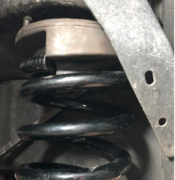
Figure 2. Synergy Leveling Spring Installed - Spring Isolator Not Fully Seated

5. Install the leveling springs. These springs are NOT side specific. Be sure to orient the spring so that the text printed on the spring is right side up and the upper coil wind interfaces with the upper spring isolator correctly. Once the springs and isolators are correctly aligned, slowly lower the vehicle so the springs are slightly compressed. Make sure that the plug on the top of the spring isolator is correctly oriented and fits in the corresponding hole in the coil tower. Using some soap or window cleaner as a lubricant can help. See Figures 2 and 3: