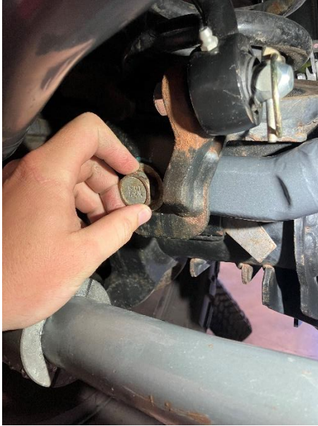
Figure 4. Installing the Axle End Bolt