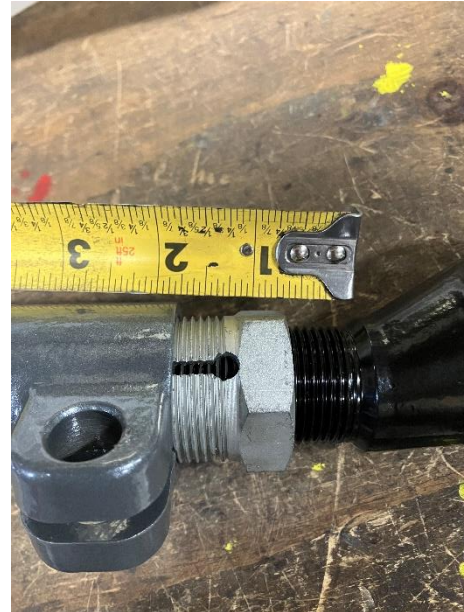
Figure 11. Max Angled DDB Forging Stick Out