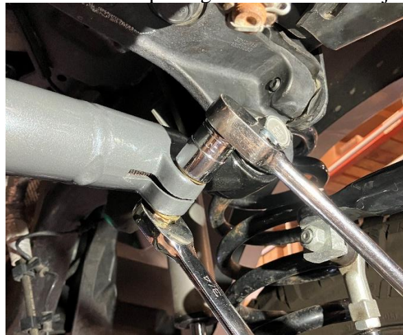
Figure 12. Tightening Pinch Bolt.