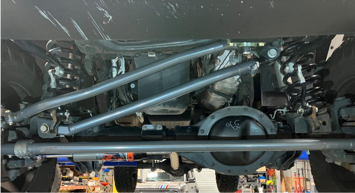
Figure 13. Completed Installation