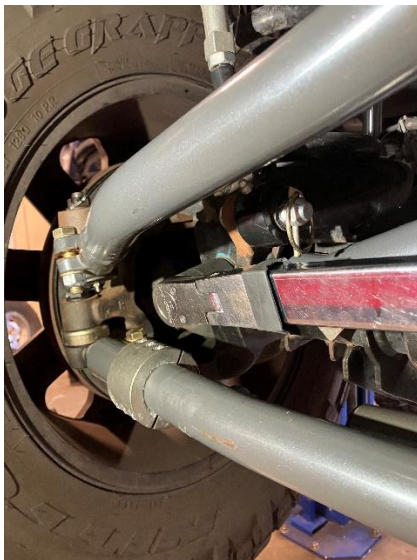
Figure 8. Torqueing Axle Side Bolt