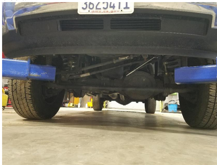
Figure 1. Supporting the Front of the Vehicle on a Lift