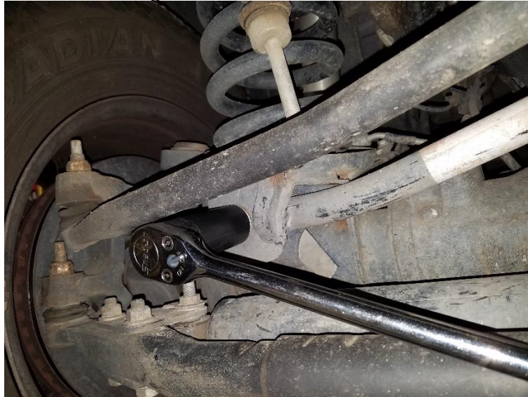
Figure 2. Unbolting the Axle Side of the Front Track Bar