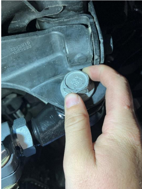
Figure 6. Installing the Frame Side Bolt