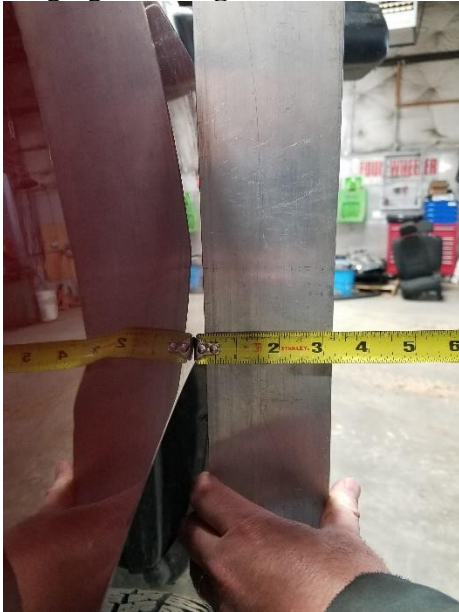
Figure 10. Measuring Axle Side to Side

adjuster clockwise shortens the bar, moving the axle towards the driver side of the vehicle. We recommend rotating the sleeve until one of the slots in the sleeve lines up with the slot in the track bar. Do not exceed 1.75" from the track bar end to the end of the threads on the shank of the angled DDB forging! See Figure 11 .