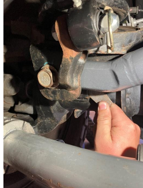
Figure 5. Holding the Flag Nut for Assembly