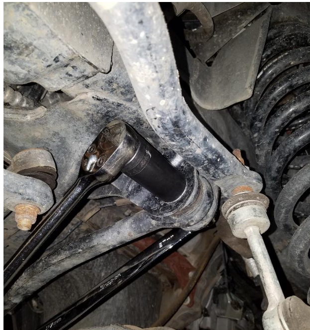
Figure 3. Unbolting the Frame Side of the Front Track Bar