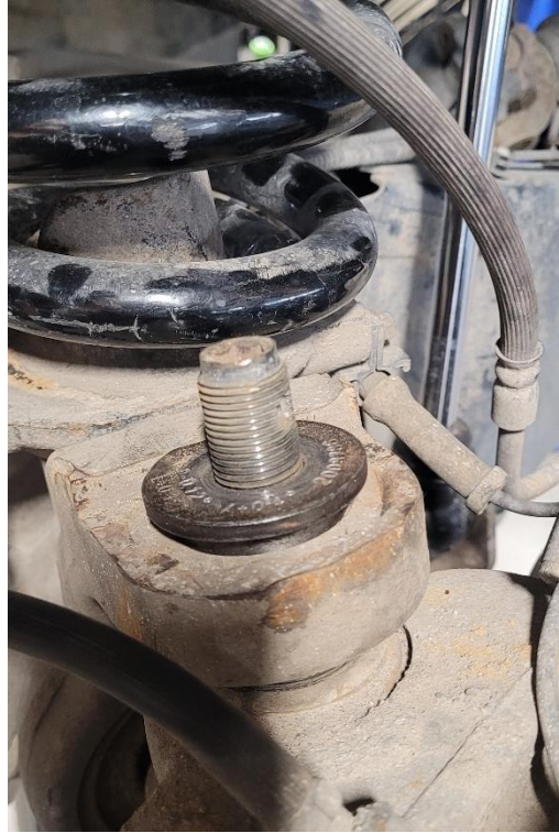
Figure 1. Drivers Side Nut and Cotter Pin Removed from Upper Ball Joint.