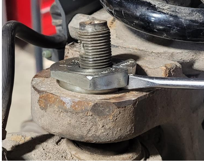
Figure 6. Rotating the Shim With a Screw Driver to Fine Tune Camber.