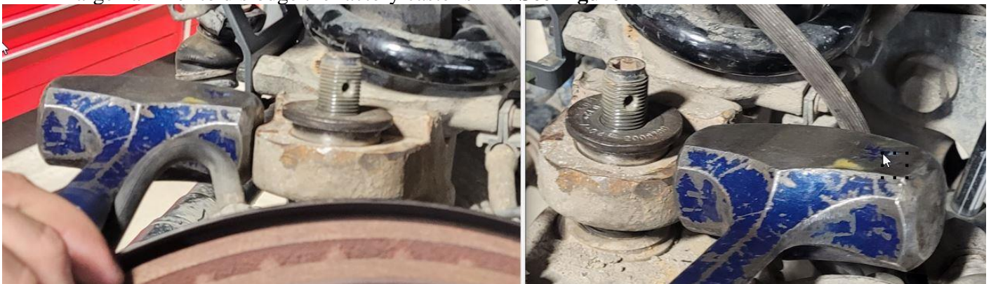
Figure 2. Dislodging the Factory Caster Shim.