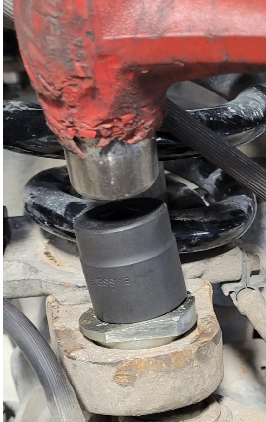
Figure 5. Tapping the Shim Into Position.