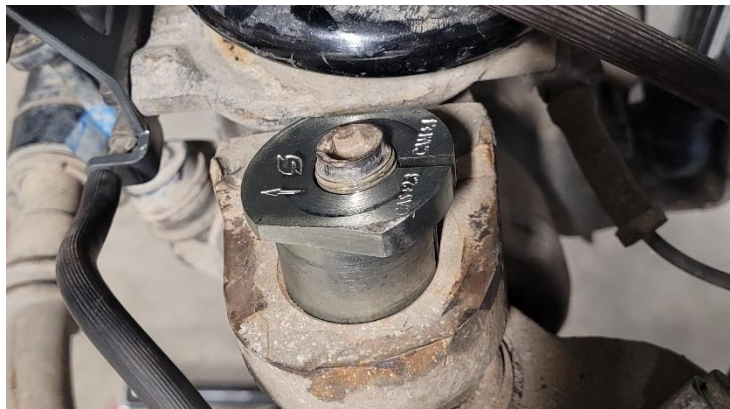
Figure 4. Start the Shim with the Arrow Pointing Forward.