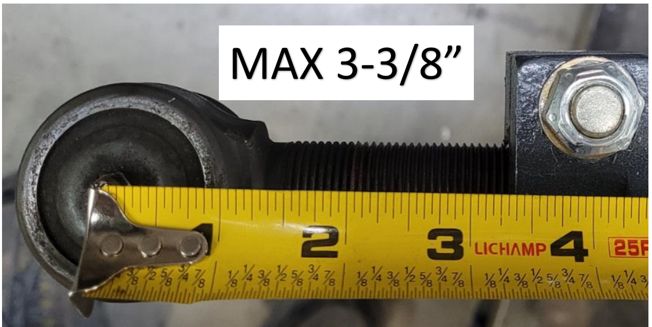
Figure 5. Non-Double Adjuster Tie Rod End Adjusted to MAX 3-3/8\".