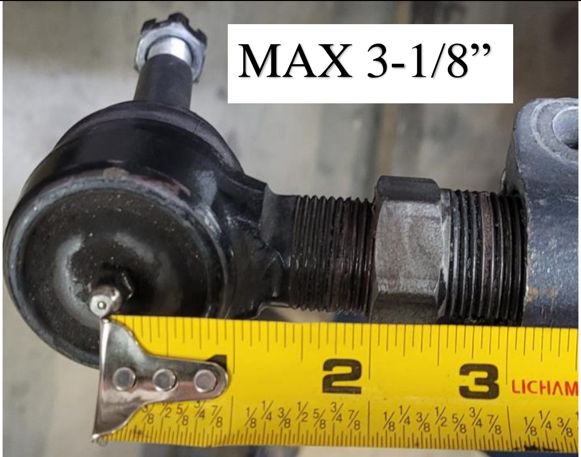
Figure 4. Double Adjuster Tie Rod End Adjusted to MAX 3-1/8\".