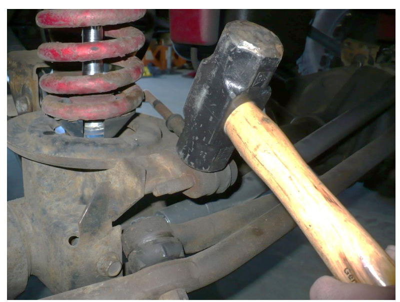
Figure 1. Using Hammer to Release Taper Fit

1. Remove the stock sway bar end links. It is easiest to remove the upper attachment points first and swing the sway bar up out of the way. Depending on model year, the lower mounting bolt size will vary, as will the attachment point on the axle end. Note, some sway bar links are tapered and will require knocking out with a hammer. See Figure 1.