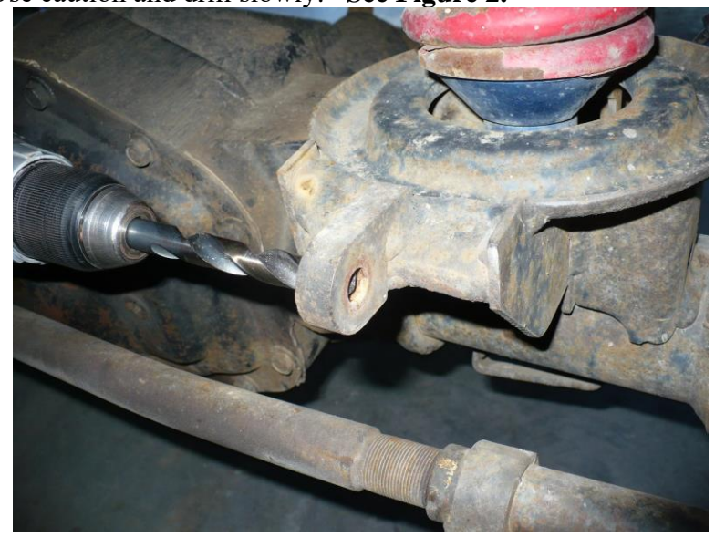
Figure 2. Drilling Out Lower Mount to 1/2"

2. Some model trucks will require drilling out the lower mount. With stock sway bar links removed, check fit a 1/2" bolt in the lower mount. If the bolt hole is too small for the 1/2" bolt, drill it out using a 1/2" drill bit. Use caution and drill slowly. See Figure 2.