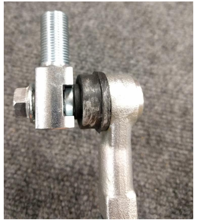
Figure 3. Properly Assembled Sway Bar End Link

3. Assemble the end links as shown below. Ensure the wrench flats on the stud end mate up with the machined slot in the adapter. See Figure 3.