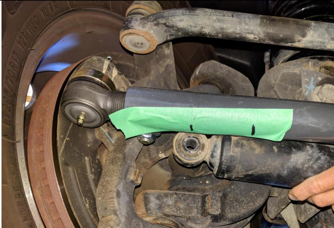
Figure 2. Steering Stabilizer Fully Extended, Steering Full Lock Passenger