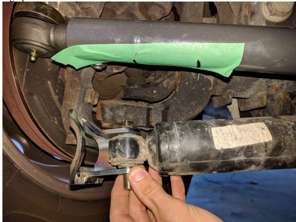
Figure 3. Correct Orientation of Steering Stabilizer Clamp