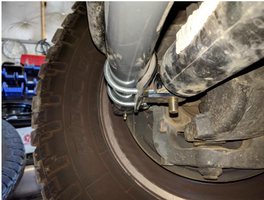
Figure 5. Clamp Installed with Bolt Perpendicular to Ground