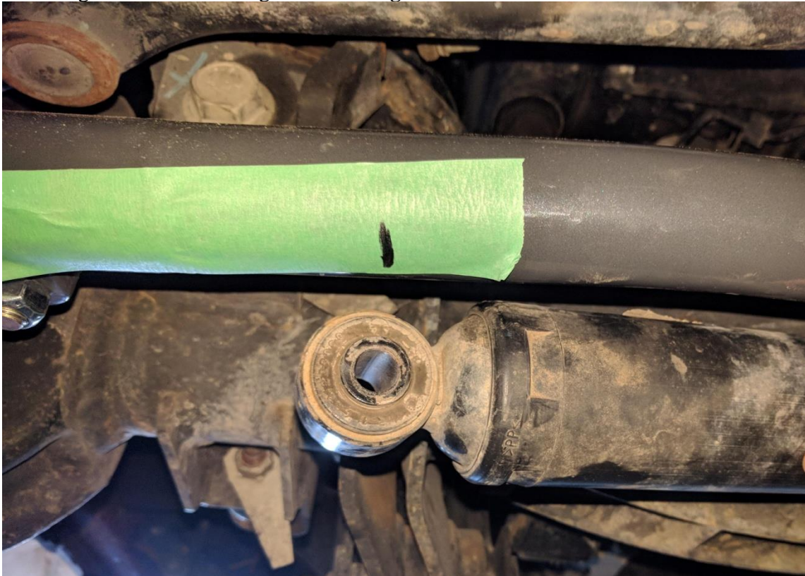
Figure 1. Steering Stabilizer Fully Collapsed, Steering Full Lock Driver